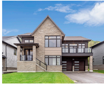
FRONT ELEV D