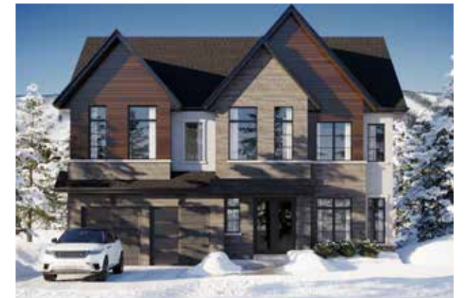
ELEVATION D 2,987 SQ.FT