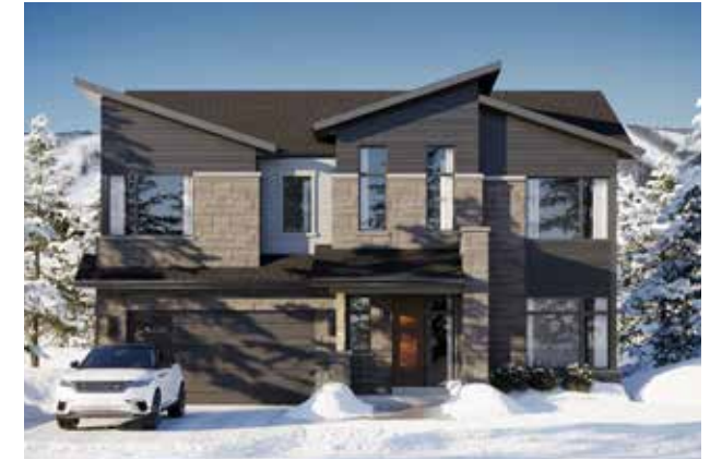
ELEVATION B 2,994 SQ.FT